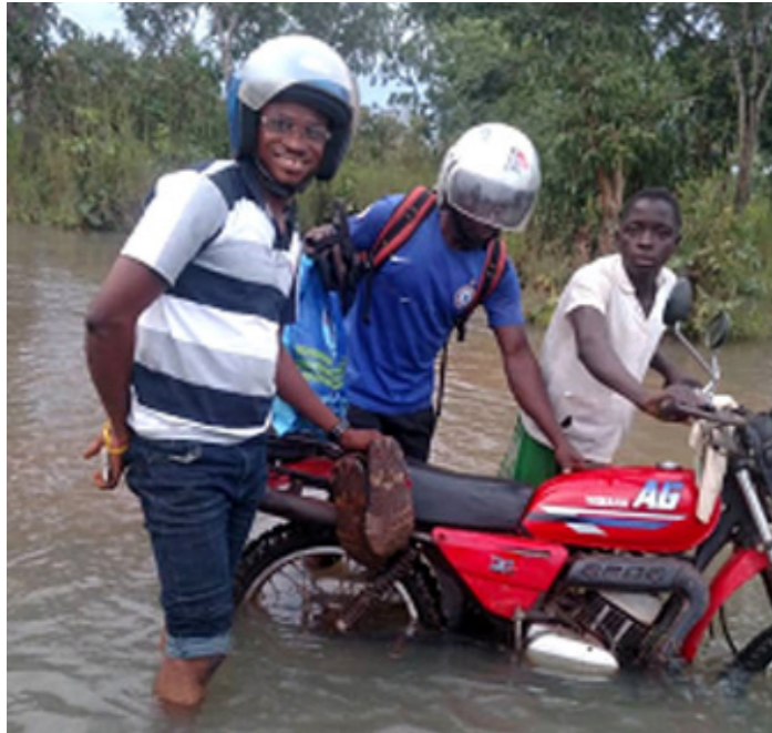
Facilitators from Kbandai Community in Tamale Crossing a river for Training