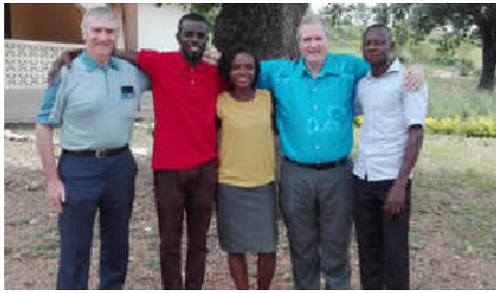
SELL Ghana resource team