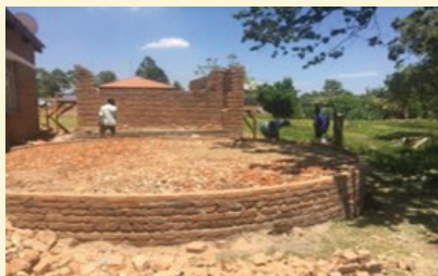
Constructing our building in Malawi