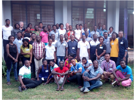
SELL Volunteers, Tamale zone.