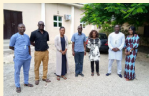
The SELL team in Nigeria