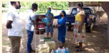
SELL support at Immaculate Conception Clinic

Highlight: It was heartwarming to receive support from St. Patrick's Missionary Society and Friends of Africa, Ireland, in giving support to our communities. The commitment level of the volunteers was also outstanding. Our deepest gratitude to all our benefactors and friends. Thank you for your love and generous spirit.