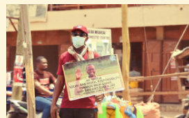
SELL Volunteer on a Covid-19 awareness campaign in Ghana

Volunteers met some key community stakeholders to call on them to commit to promoting peace in their communities. Stakeholders signed a Peace Signage Banner. Stakeholders included; the Overlord of Tamale, The Chief Imam, the secretary to the Justice and Peace council of the Northern Region, the Regional Police Commander and Youth Groups that are key during Political/Election Periods. Radio awareness campaign, Peace Walks, Stakeholders Engagement, workshops on Peace Building were organised to help create awareness on the importance of peace.