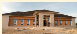
Our New Resource centre in Nigeria