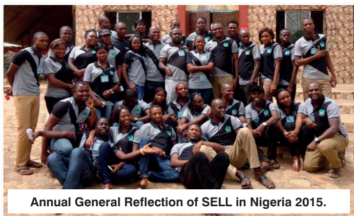
Annual General Reflection of SELL in Nigeria 2015.

SELL started in Kabba, Kogi State, Nigeria and later moved to Bauchi State, Nigeria in 2007; training of facilitators in Ghana began in 2013.